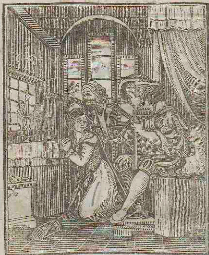
" An Apostrophe to DEATH.

Why dost thou, pale and envious Death, A sacred Maid affright ? Small Glory to thee can arise From Victories so slight.