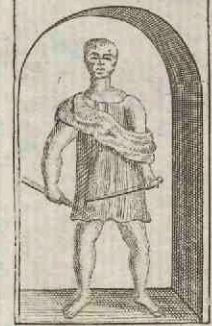
Roman Pavement found near London Stone