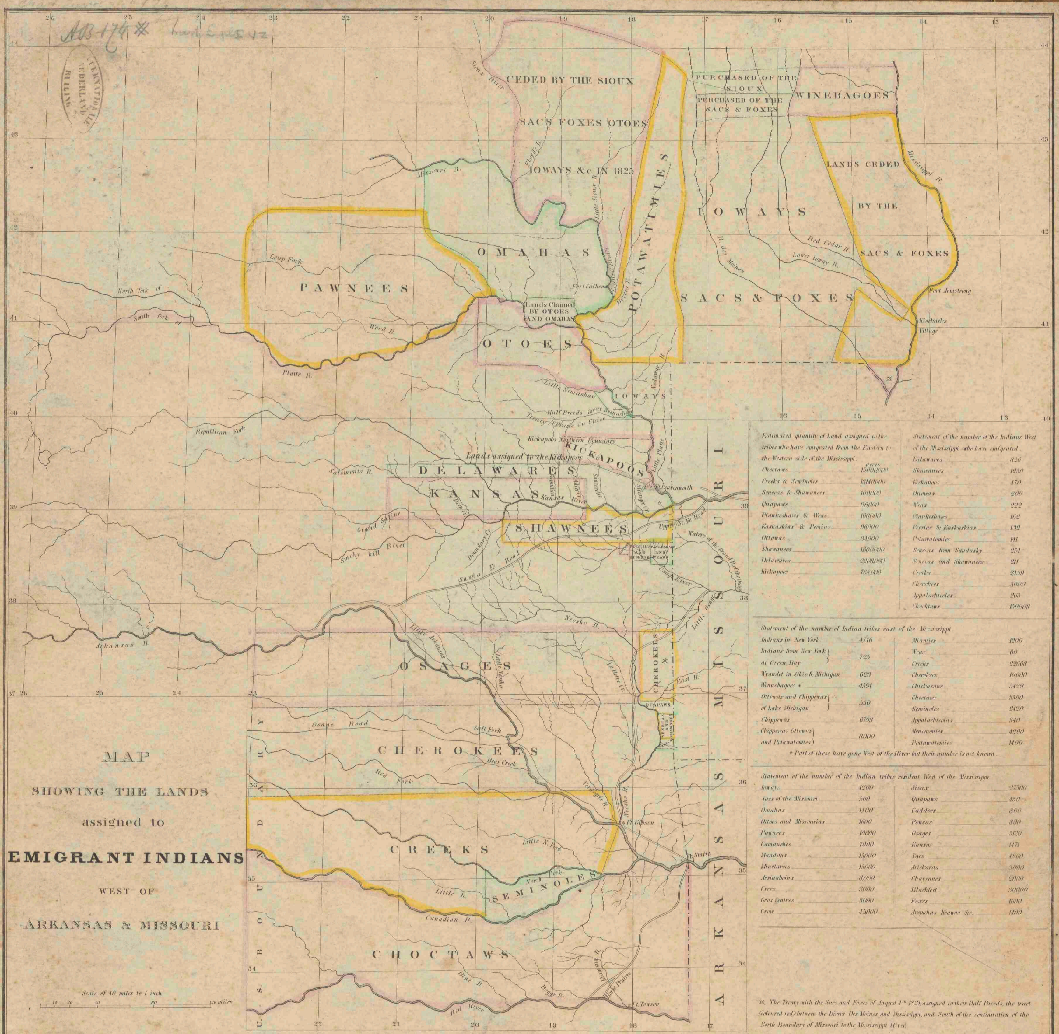
MAP SHOWING THE LANDS assigned to EMIGRANT INDIANS WEST OF ARKANSAS & MISSOURI

Scale of 40 miles to 1 inch 10 20 30 40 50 miles